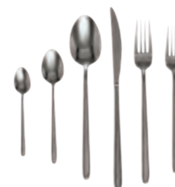
STILETTO ligne roset Cutlery in 18/10 stainless steel.