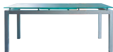
FIRST GLASS ligne roset

Dining table with two 12 mm thick toughened glass tops & central 60 cm extension: the principle of this table is to extend whilst leaving the legs at each end - when fully extended the extension slides into place automatically. Choice of anodised aluminium frame with clear glass tops, or black anodised aluminium frame with anthracite glass tops.