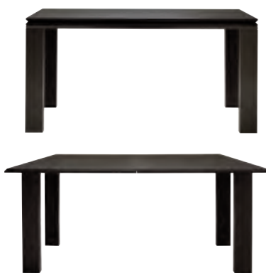
PORTEFEUILLE Pascal Mourgue

Frame in lacquered steel; top in 22 mm thick oak veneered or lacquered MDF. Base in lacquered MDF. This table accommodates 4 persons; the top pivots on itself and opens out to double its surface area, in which case it will accommodate 6-8.