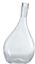
BOHÈME Fred Lambert Carafe with stopper in clear mouth-blown glass. H 30 Ø 14.5