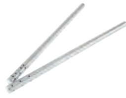
ABRACADABRA Emilie Littras Magic wand-shaped salt & pepper shakers in food-grade stainless steel. L 32 Ø 1.4