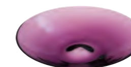
ANTONIA Arik Levy ©-Design Fruit bowl in olive green or grape-coloured mouth-blown glass. H 7.5 Ø 40