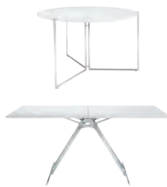
F2 & F10 Nils Frederking

F2 : round folding table with top comprising 3 articulated panels. Base in chromed steel; top in slatted multi-ply finished in either lacquer or veneer. When folded, table is 8 cm thick. F10 : folding table with base in chromed steel and top in slatted multi-ply finished in either lacquer or veneer. When folded, table is 8.5 cm thick.