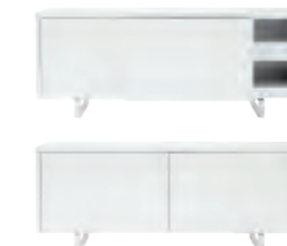
COPLAN Pagnon & Pelbaître

3-door sideboard (1 internal drawer): H 75 W 189 D 45 4-door sideboard (2 internal drawers): H 74 W 250 D 45