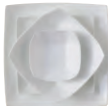
LOTUS Siw Matzen Crockery in brilliant white enamelled bone china. Small plate: H 3 W 20 D 20 Large plate: H 3.5 W 27 D 27 Curved plate: H 6.2 W 20 D 20 Dish: H 5.5 W 13 D 13