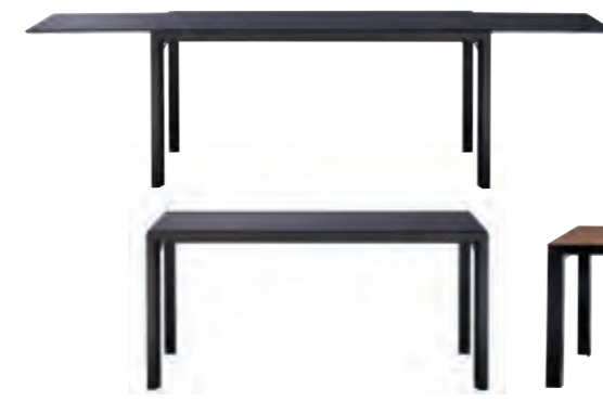
EXTENSIA ligne roset

Extending H 75 W 175.5 D 100 Fixed H 75 W 160/170/180/190/200/210/220/230/240 D 100