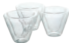
AIR CUP Jean Marc Gady Espresso cups in mouth-blown heat-resistant borosilicate glass. H 7 Ø 7.8