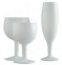
BALTO Guillaume Bardet Sets of 6 glasses in white opaline mouth-blown glass. Wine glasses H 12.5 Ø 7.3 Water glasses H 14 Ø 9 Champagne flutes H 19.5 Ø 5.5