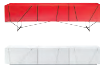
LINES Peter Maly

Low sideboard, set on either a solid base, or an underframe; drawers are equipped with an internal drawer ('tiroir à l'anglaise'), with DVD storage in the main drawer. Choice of finishes: gloss white lacquer with satin white interiors, or gloss anthracite or gloss red lacquer, both with satin anthracite interiors.