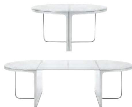
HYANNIS PORT Eric Jourdan

Dimensions: H 74 Ø 130 (EXTENDED LENGTH: 250 CM)