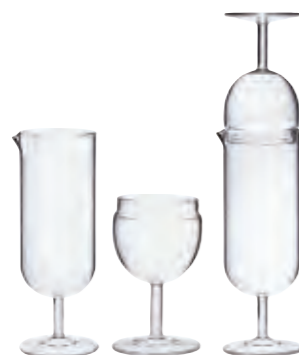
SPOUTNIK Guillaume Bardet Glass & carafe in mouth-blown heat-resistant borosilicate glass. Glass H 13.3 Ø 8 Carafe H 23 Ø 8