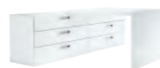
CINELINE Pagnon & Pelbaître

Sideboard with 2 doors & 3 drawers: H 94 W 207 D 44 Sideboard with 2/3/4 doors: H 94 W 138/207/276 D 44