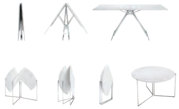
F2 & F10 Nils Frederking