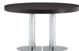
CRAFT Delo Lindo

Extending dining table with 2-part central steel pedestal finished in a combination of brilliant chrome (bases) & matt chrome (trim): pedestal supports two half-moon tops which slide apart to take two 60 cm extension leaves, which have fixings to enable them to be hung in a cupboard when not in use. Seats 6 when closed, and 10-12 when extended. Choice of finishes: dark brown or ebony-stained oak or gloss white lacquer.