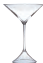
MARTINI CHERI Martino D'Esposito Glasses in clear moulded mouth-blown glass. H 18 Ø 13