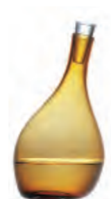
BOHÈME Fred Lambert Carafe with stopper in amber-coloured mouth-blown glass. H 30 Ø 14.5