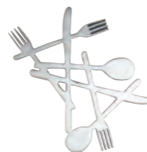
EVLAN Tous Les Trois Plate stand in moulded brilliant-polished aluminium (NB except edges). H 1.5 W 21 L 32