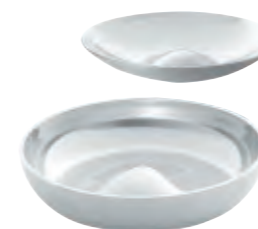
TONIA Arik Levy ©-Design Fruit bowl in moulded brilliant-polished aluminium. H 7 Ø 30 H 10 Ø 50