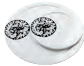
BON THÉ Tous les Trois Plates in gloss white enamelled vitro porcelain with black motif to one side. Small H 0.9 Ø 17 Large H 0.9 Ø 26.8