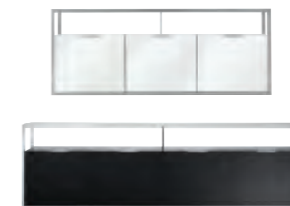
CONTOURS Didier Gomez

4-drawer sideboard H 72 W 196 D 50 Sideboard with 2 doors & 3 drawers H 72 W 196 D 50