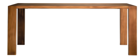
EATON ligne roset

A contemporary solid wood table, treated with oil & finished with matt varnish. Available in solid walnut, oak or cherry, in a range of widths & depths; new for 2009, an extending version with removable 50 cm extension leaf, to be positioned at one end once the feet have been pulled out. Matching bench also available.