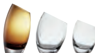
CUT Philippe Daney Small, large or extra-large glasses in clear or amber-coloured mouth-blown glass. H 9 Ø 6.5 H 11.5 Ø 8 H 14 Ø 7.5