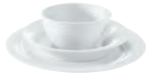
PAYSAGES J.F. Dingjian - E. Chafai Crockery in gloss white enamelled moulded porcelain. Curved plate H 3.6 Ø 23 Dessert plate H 2 Ø 20 Bowl H 7 Ø 14.7