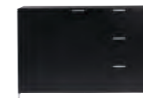
EVERYWHERE Christian Werner

Sideboard with 2 doors & 3 drawers: H 79.7 W 160 D 52 Sideboard with sliding doors: H 79.7 W 197 D 52