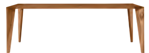
TRAPEZE Evangelos Vasileiou

Dining table H 74 W 90 L 140 Dining table H 74 W 90 L 165