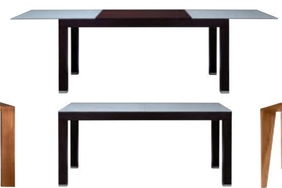
EUREKA ligne roset

Fixed version H 76 W 160/170/180/190/200/210/220/230/240 D 90/100 Extending version H 76 W 110/120/130/140/150/160/170/180/190 D 90/100