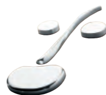
BORO Tous les Trois Plate stand in moulded polished aluminium. H 2 W 48 D 25