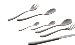
MINUIT Lucas Poupel Cutlery in forged anthracite-coloured 18/10 stainless steel.