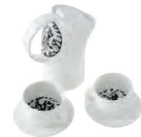
BON THÉ Tous Les Trois Tea service in gloss white enamelled vitro porcelain with black motif, or satin black. Teapot: H21 W11 D18 Cup: H6.5 W9.5 Saucer H1.07 Ø14