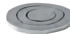
SILICATE Philippe Daney Plate stand in moulded brilliant-polished aluminium. H 1.5 Ø 24