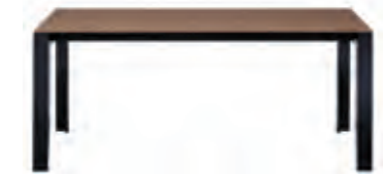
8 A 12 Idelfonso Colombo

Dining table H 74 W 94 L 94 / 140 / 160; H 74 W 109 L 180