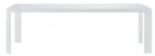
CONTOURS Didier Gomez

A generously-proportioned dining table, available with a fixed top or with an extension leaf. Top finished in dark brown, natural or ebony-stained oak veneer or oiled, varnished solid American walnut (fixed version only). Legs in oak-clad or walnut-clad solid wood – parallel to top at one end, & perpendicular to it at the other.