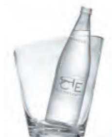
INCLINE 12 Loudor design - JF D'Or Pair of stopping champagne pails in moulded mouth-blown glass. H 23 Ø 21.5