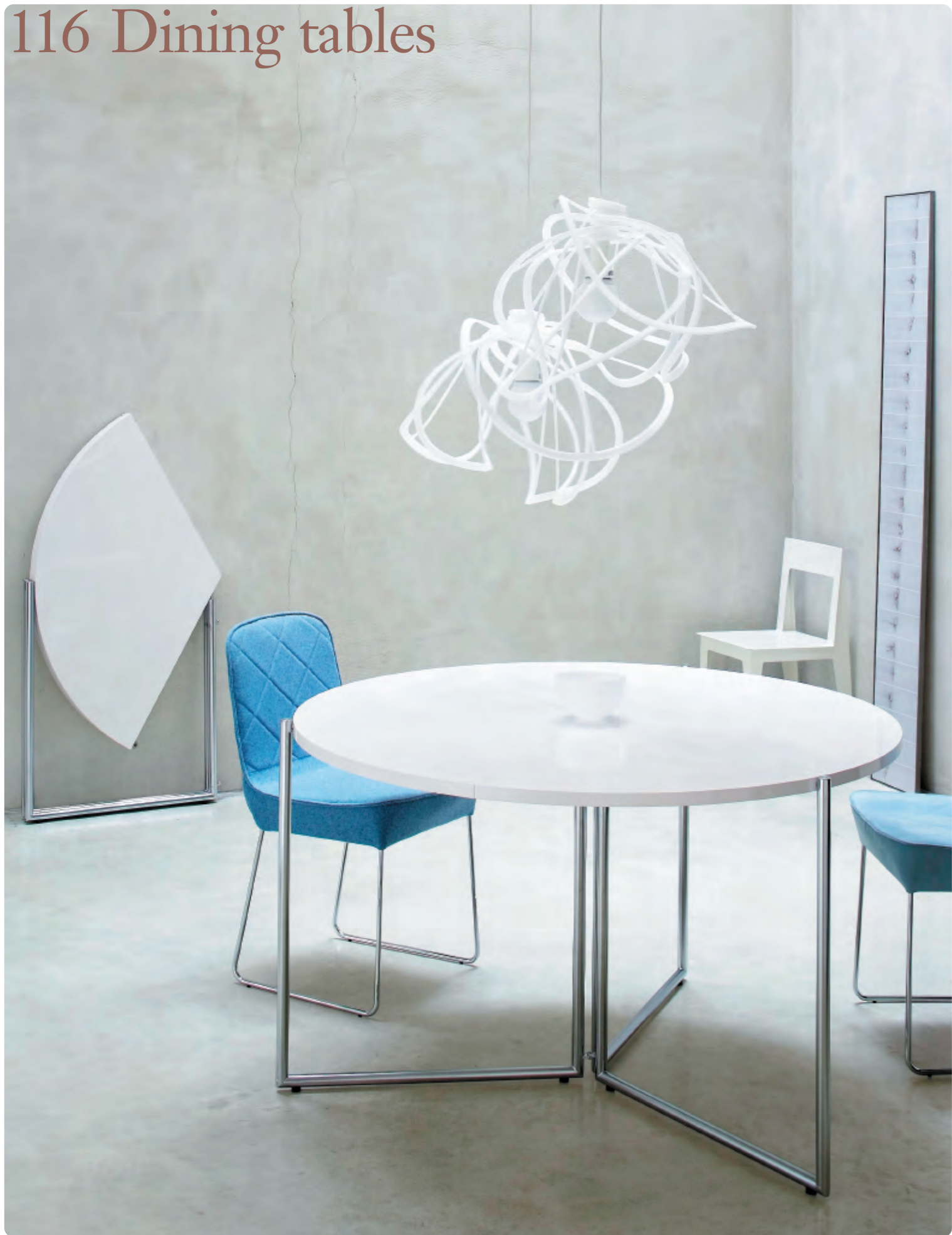
F2 Nils Frederking Pages 116-117, 120