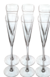
PYTHAGORE Alexandre Gaillard Set of 6 champagne flutes in mouth-blown glass, in an eye-catching inverted pyramid shape. H 23 Ø 6.5