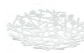
EPLAFF Tous Les Trois Fruit bowl in laser-cut sheet steel finished in gloss white lacquer. H 6 Ø 58