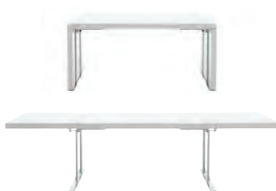
CINELINE Pagnon & Pelhâitre

A majestic table combining ingenuity, technology and aesthetics. Top in gloss white lacquered alveolar panels with brilliant-chromed steel feet; extensions are stowed vertically beneath the top on the two 'short' sides, and then lifted to horizontal position. Seats 6 when folded, and 10-12 when unfolded.