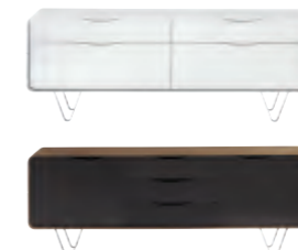
CEMIA Peter Maly

Sideboard with 2 drawers H 41.9 / 60 W 150 D 56. With 2 drawers & pull-down flap H 41.9 / 60 W 220.5 D 56