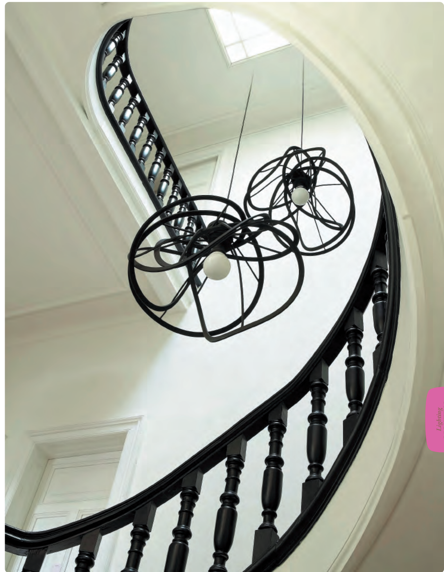
BLOOM Hiroshi Kawano Pages 163, 164