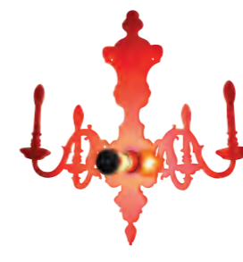
LOUIS 5D Blandine Dubos

Wall light in orange/red Plexiglass. Shaped like a 17th-century chandelier, the enlarged shadow of its outline is projected onto the wall behind it.