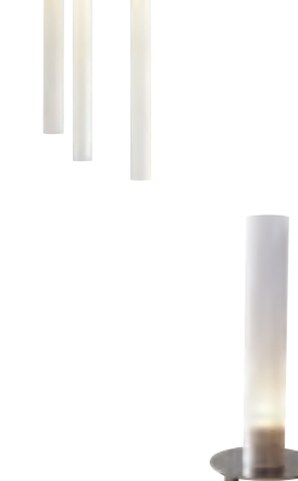
TUBA Dögg Design

Table lamp H 52 W 15 D 9 Ceiling light H 130 Ø 40