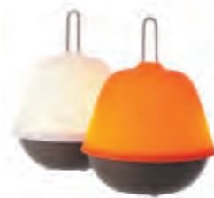
LUCILLE Sylvain Rieu-Piquet

Table lamp H 56 W 18 D 29 Wall light H 39.5 W 18 D 26