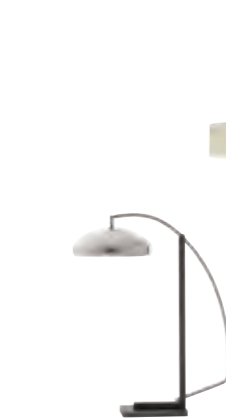
MAMA Tibault Desombre

Adjustable table lamp with polished aluminium shade.