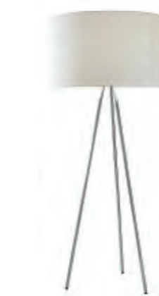
TRIS ligne roset

Pair of floor lamps in brilliant-chromed steel with shades in white PVC.