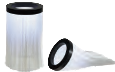
A POILS Marc Sarrazin

Table lamp H 40 Ø 30 Ceiling light H 132 Ø 30