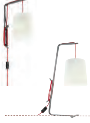
ARIANE Edouard Larmaraud

Reading lamp/occasional table H 135.50 Ø 45