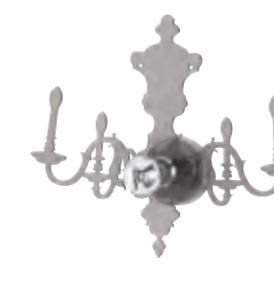
LOUIS 5D Blandine Dubos

Wall light in 'smoked' Plexiglass. Shaped like a 17th-century chandelier, the enlarged shadow of its outline is projected onto the wall behind it.