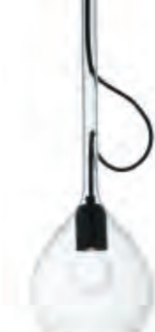
SERPENTINE Jörg Höltje/Studio Hausen

Suspended ceiling light in mouth-blown borosilicate.