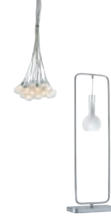
IV Arik Levy ©-Design

Table lamp: H 40 Ø 11 Reading lamp: H 130 Ø 15 1-cable ceiling light: H 134 4-cable ceiling light: H 134 W 63 D 7 9-cable ceiling light: H 140.5 W 40 D 40