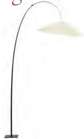
PÊCHE DE NUIT Pascal Mourgue

'Fishing rod' floor lamp with telescopic glassfibre structure finished in Epoxy black lacquer. Shade in fire-retardant jersey fitted with steel wire.