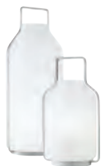
SOMERSET Eric Jourdan

Small & mini table lamps in matt opal glass, in the shape of an old-fashioned milk churn. Tube & base in brilliant-chromed metal.