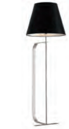
NUIT D'ARGENT Frédéric Ruyant

Luminous totem H 180 W 22 D 36 Wall light H 25 W 21