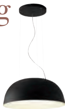
LOA Sébastien Jupille

Suspended ceiling light in 'marron glacé' (chestnut) coloured repoussé anodised aluminium. Interior in white injected polycarbonate.