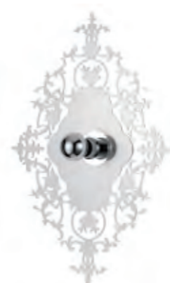
JOSEPHINE 5D B. Dubos - R. Fard

Following in the footsteps of the enormously successful Louis 5D wall light, Josephine 5D is supplied with a connection box for attachment to a wall or ceiling, or alternatively can be plugged into a socket.