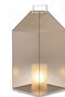
FES Didier Gomez

An extra-large, lantern-shaped atmospheric table lamp. Base in Epoxy grey-beige lacquered metal; shade in smoked Plexiglass. E27 100 W bulb.