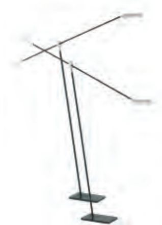
COOL BALANCE Arik Levy ©-Design

Table lamp H 58 Ø 10 Reading lamp H 130 Ø 12 4-cable ceiling light H 130 W 76