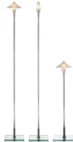
TULIPE Pascal Mourgue

Table & reading lamp with base in glass & heat-resistant borosilicate glass tube.