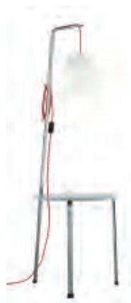
ARIANE Edouard Larmaraud

Reading lamp/occasional table with titanium-coloured steel structure, white opal PMMA shade & red textile cable.