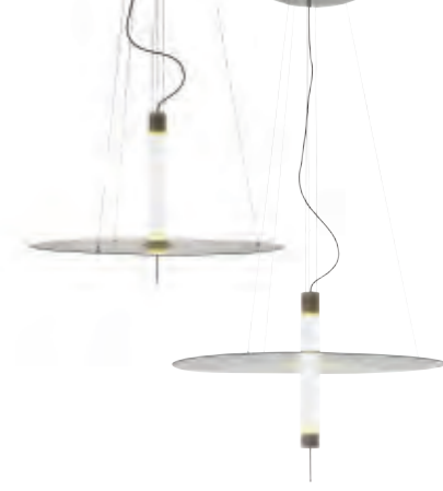
CATCH ME Marc Venot

Suspended ceiling light comprising 2 Dibond discs linked by steel cables; lower disc has a hole in the centre & can be slid up & down the tube using the chromed metal handle, thus varying the light intensity.