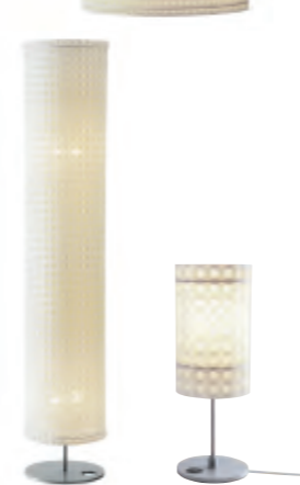
OCTOPUSS Arik Levy ©-Design

Table lamp H 55 Ø 15 Reading light H 145 Ø 18 4-cable ceiling light H 130 W 76