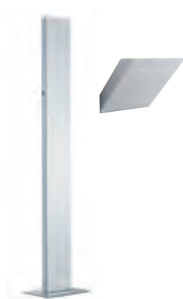
SAM Lora Dezign

Luminous totem in anodised aluminium with grey lacquered base, or white lacquered aluminium with white lacquered base: equipped with fluorescent tube & halogen light, & optional full-height mirror on front. Also available as a wall light (anodised aluminium only).