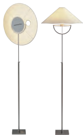
LA CHINOISE Pascal Mourgue

Height-adjustable floor standard lamp with pivoting white chintz shade.