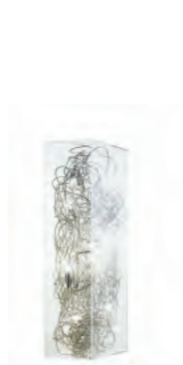
CHIO ligne roset

Reading light H 106 W 65 D 10 Occasional table H 60 W 22 D 35