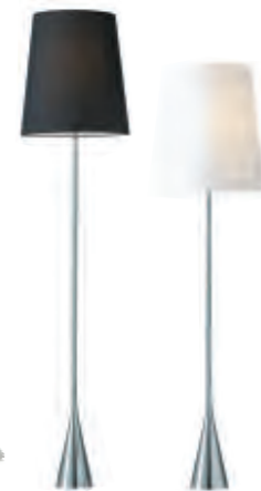
PASCAL MOURGUE Pascal Mourgue

Floor lamp & reading lamp with bases & stems in brilliant chrome or aluminium lacquer; shades in black or white cotton.