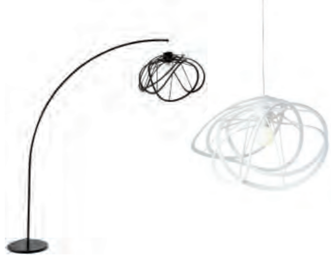
BLOOM Hiroshi Kawano

An unusual floor standard lamp from a young Japanese designer – a highly graphic creation which was discovered by ligne roset at the ‘Young Design Ausstellung’ at the IMM Cologne 2007. Shade comprises black or white interlocking rings cut from polyether foam. Metal stem finished to match shade.