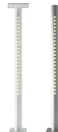
EXTENSIA ligne roset

Desk lamp H 86.5 W 52 Reading lamp H 120/170 W 30 D 15