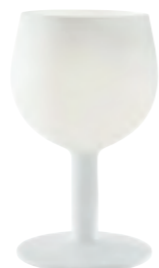
BALTO Guillaume Bardet

Table lamp in matt opal glass with transparent cable.