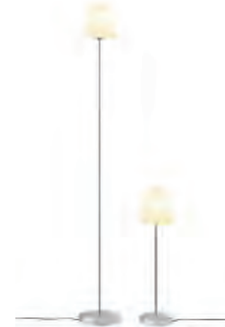
BARBARA Elia Gilli

Table & reading lamp with opal glass shade, chromed steel stem & satin glass base.