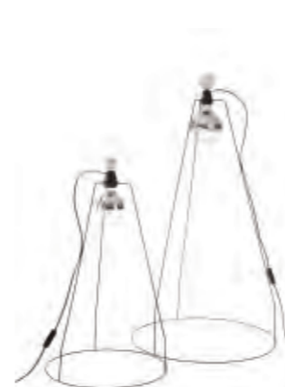
LAMP 06 Nathalie Dewez

An impressive filigree light. Stainless steel structure with black cable. Energy-saving lights providing soft light.