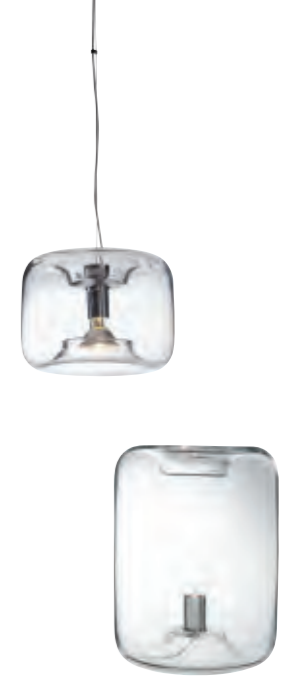
BONBONNE Laudor design-JF d'Or

Table lamp & ceiling light in clear glass.