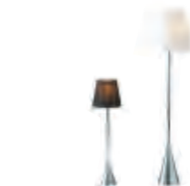
PASCAL MOURGUE Pascal Mourgue

Floor lamp H 198 Ø 45 Reading lamp H 170 Ø 45