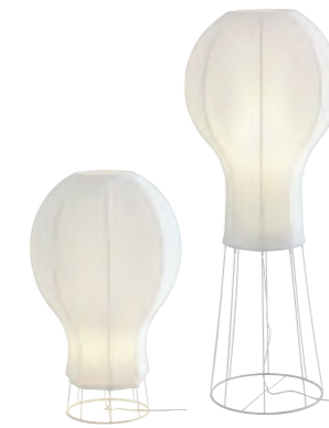
ELIO Delo Lindo

Table, reading & floor standard lamps with white lacquered bases & lycra polyamide shades.