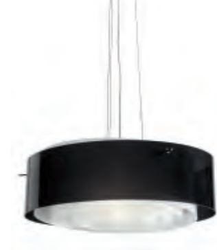
CHROMA LUX Matthieu Paillard

Suspended ceiling light comprising 5 Plexiglass filters (4 white inner filters & 1 anthracite-coloured outer filter).