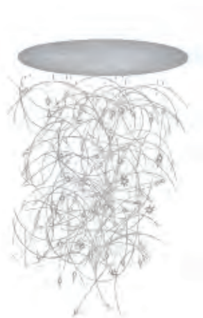
BRINDILLES François Azambourg

A spectacular ceiling light combining fibre optic cables & LED's. Winner, VIA 2006. Cables may be shortened if required (min. overall height 1.10m).