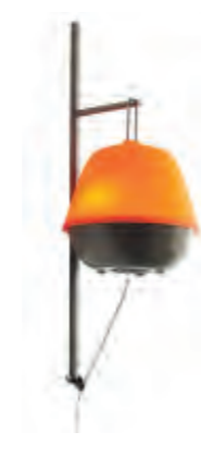
LUCILLE Sylvain Rieu-Piquet

With the addition of a wall support in matt grey lacquered steel, the LUCILLE table lamp can be used as a wall light.