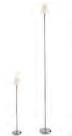
NANO Frédéric Sofia

Table lamp, reading lamp & suspended ceiling light in brilliant-chromed steel with shades in gloss white moulded glass.