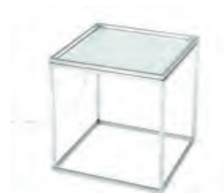
LUX Soda Designers

An elegant illuminated table, ideal to show off bottles to best effect. Brilliant-chromed steel frame with matt polished glass top edged with 120 white LED's (20 W).