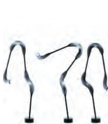
PARANOID Swann Bourotte

Table lamp: H 26 Ø 11 Ceiling light: H 150 Ø 30