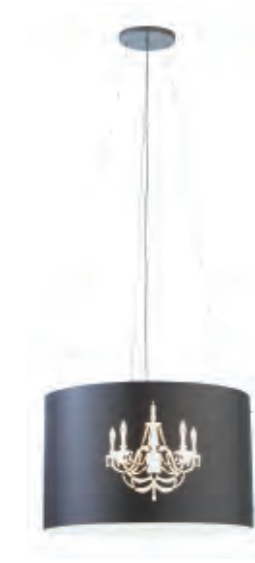
TRIPLE LUSTRE Martino D'Esposito

Table lamp H 58 Ø 14 Reading lamp H 133 Ø 17.5