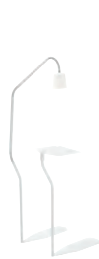
LE 5ème PIED Noé Noviant

Reading light with flexible arm in white-lacquered steel; shade in satin-finish opaline glass; touch-controlled dimmer on tube. Occasional table in white lacquered steel. In either case the base MUST be slid beneath the seat or foot of a settee, or beneath the foot of a chair.