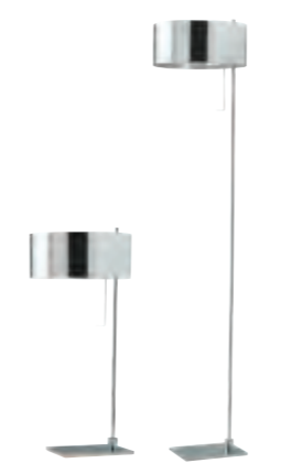
VERY THIN Arik Levy ©-Design

Table lamp, floor lamp, wall light & ceiling light in brilliant-chromed steel, with brilliant-polished aluminium shades.