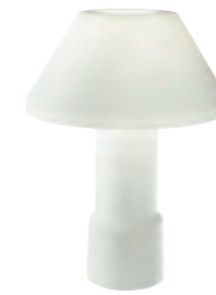
LAMPYRE Inga Sempé

Table lamp with shade in matt white opal glass.