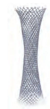
FAISCEAU François Azambourg

Table lamp H 80 Ø 23 Bedside lamp H 48 Ø 12