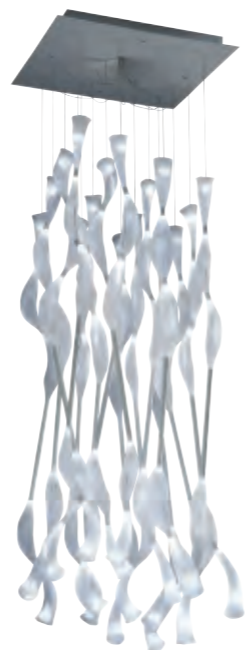
JELLYFISH Swann Bourotte

Suspended ceiling light with 16 'arms' with woven expanded covering, & 256 LED's.