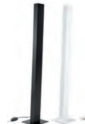
TOTEM ligne roset

Floor standard lamp in extruded lacquered aluminium, leaning slightly forwards, with indirect lighting provided by 3 different-coloured fluorescent neon tubes (red, green, blue). Finished in black or white lacquer.