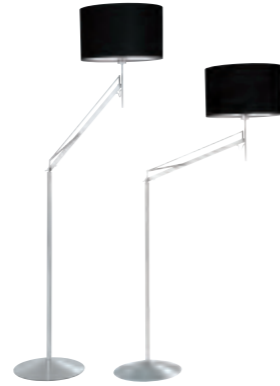
EASY LIGHT Pascal Mourgue

Articulated floor lamp in anodised aluminium & brilliant chrome with black cotton shade.