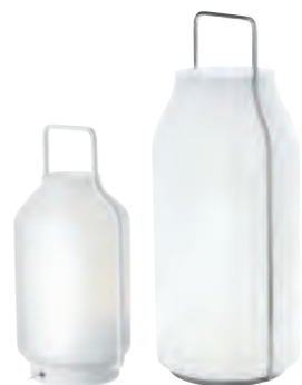
SOMERSET Eric Jourdan

Large table lamp in matt opal glass, in the shape of an old-fashioned milk churn. Tube & base in brilliant-chromed metal. New for 2009, rechargeable free-standing version (separate charger – charging time 4 hours 15 minutes, giving 3 hours 30 minutes of life).