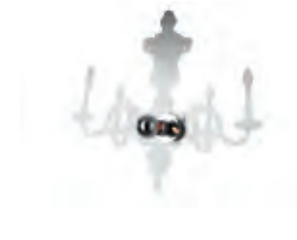
LOUIS 5D MINI Blandine Dubos

Mini wall light in transparent 'smoked' Plexiglass. Shaped like a 17th-century chandelier, the enlarged shadow of its outline is projected onto the wall behind it.