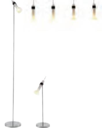
VISIO Elia Gilli

Table lamp H 70 D 70 Reading light H 210 D 95