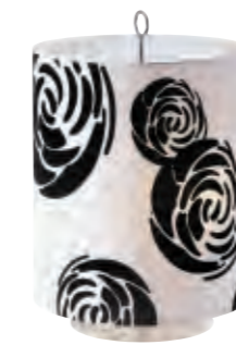
LES LANTERNES Pascal Mourgue

Table lamp with structure in brilliant-chromed steel; shade in either plain white cotton, or white cotton with black flocked motif.