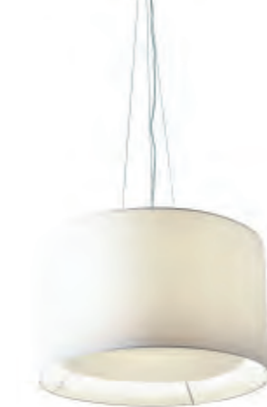
ASTRO François Bénard

A generously-sized ceiling light with white cotton shade.