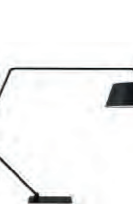
BUL ligne roset

Table lamp: H 65 W 15 D 22 Floor lamp: H 141 W 15 D 22 Wall light H 17 D 22 Ceiling light H 120 W 62 D 30