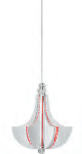
FIVE YEARS Achille

Suspended ceiling light in transparent plexiglass with a central fluorescent tube & 120 LED's, which shine through the plexiglass. Supplied with an infra-red remote control.