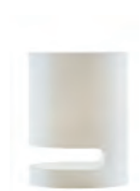
BOSS Lee West

Table lamp H 80 Ø 55 Reading lamp H 135 Ø 55 Floor lamp H 180 Ø 60